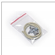
Hardware includes lid screws, PC board screws, and gasket