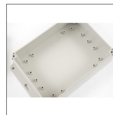
Internal mounting points for PC boards or panels