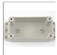
Internal DIN rail mounting point.