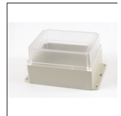
Some models supplied with deep lids.