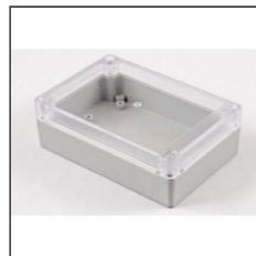
Clear Lid (polycarbonate version shown)