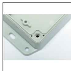
Features corrosion resistant inserts for lid assembly