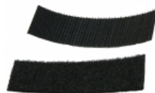
Hook & Loop Mounting Strip 1592ETV