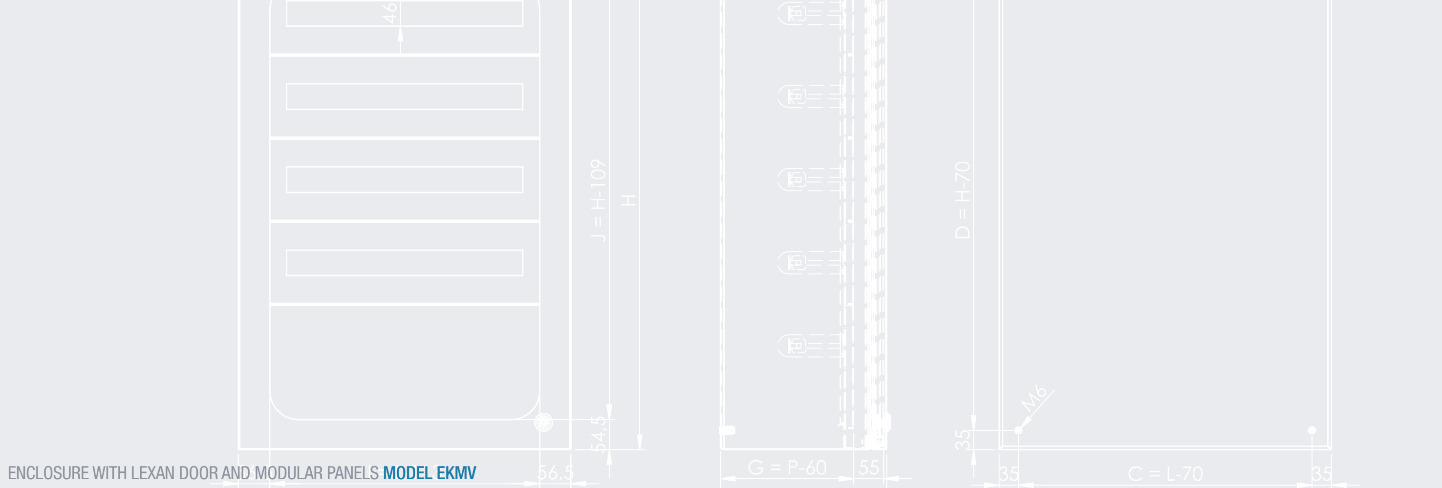
ENCLOSURE WITH LEXAN DOOR AND MODULAR PANELS MODEL EKMV